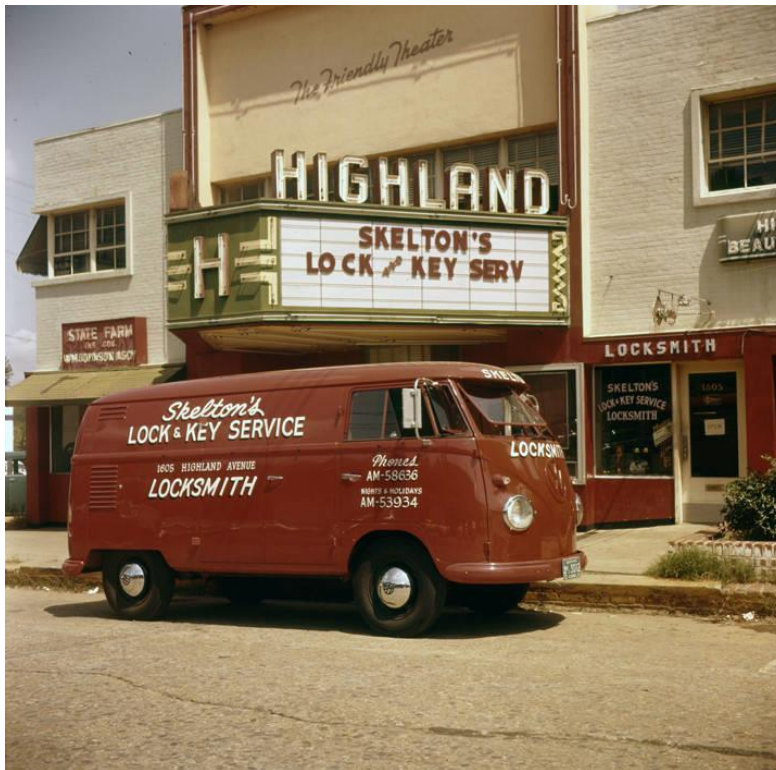
Figure 12: Highland Theatre after conversion to Shelton's Lock and Key Service, 1958.