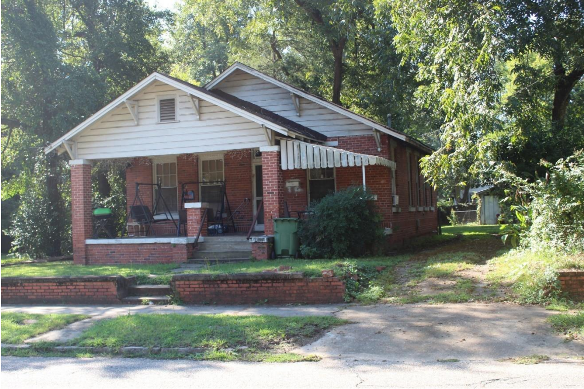
Figure 18: 2214 Highland Ave., 09/19/24.