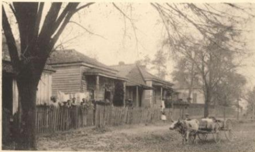
SCENE ON UNION STREET.