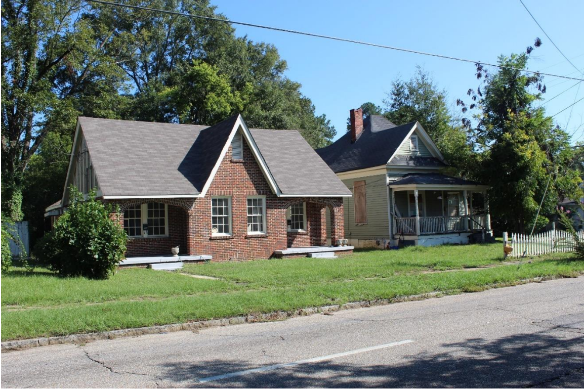
Figure 19: 2329 & 2335 Highland Ave., 09/19/24.