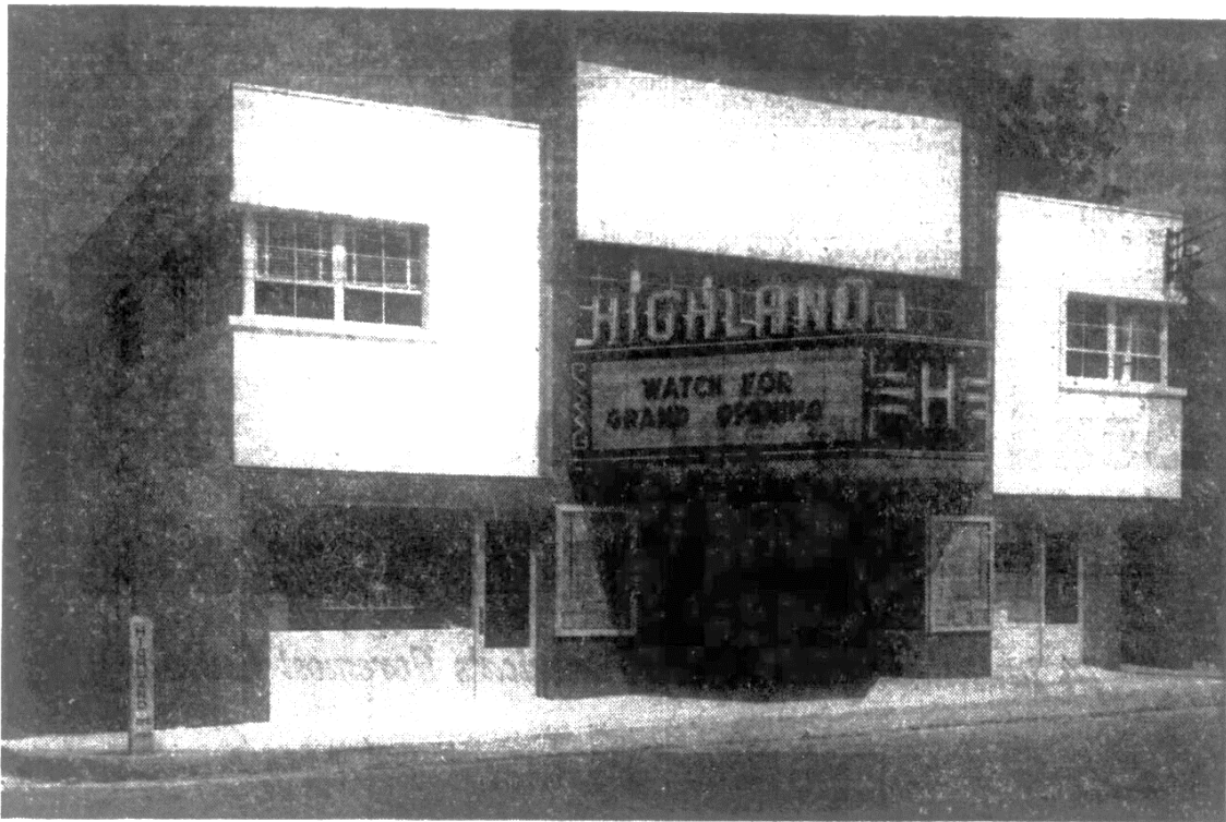
Figure 11: Highland Theatre, 1948.