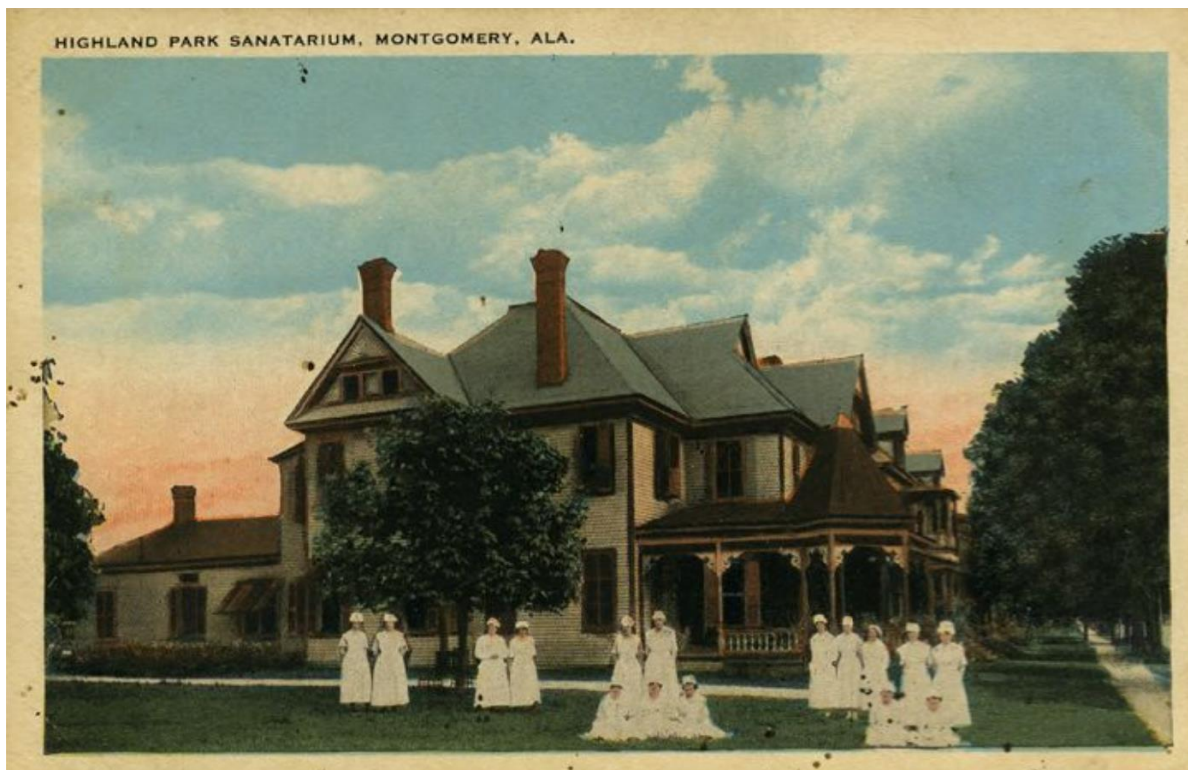
Figure 7: Highland Park Sanatorium, c. 1910-1929.