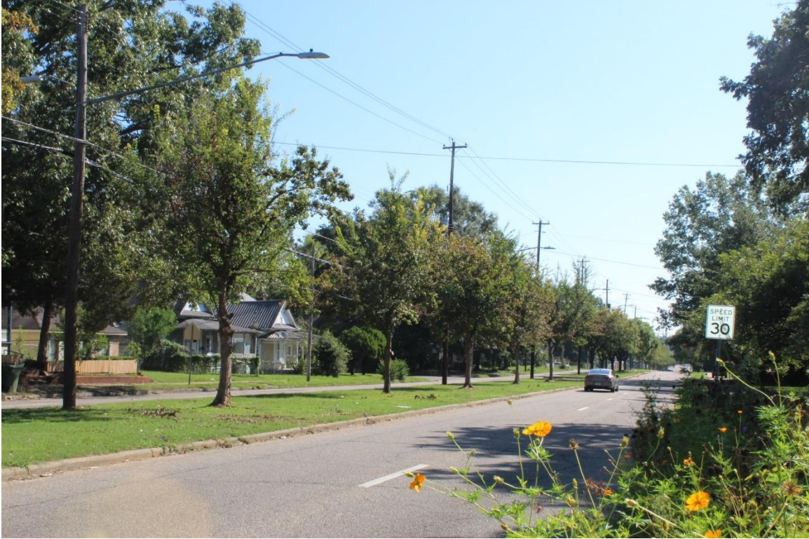
Figure 14: Highland Avenue median and streetscape 1, 09/19/24.