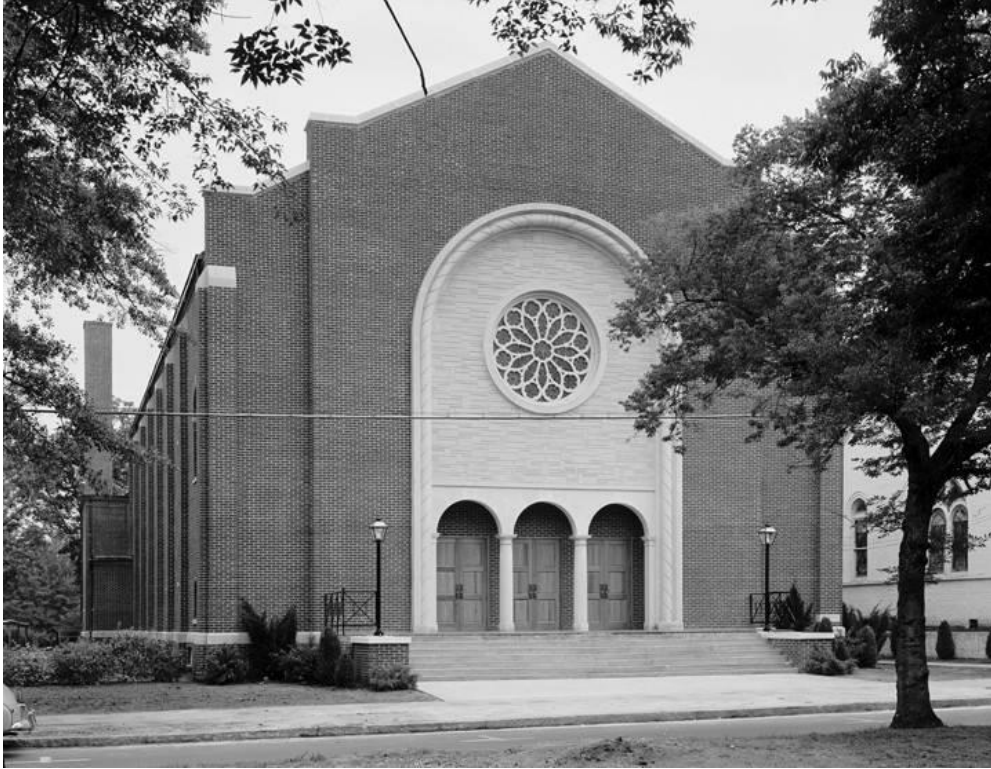
Figure 10: Highland Avenue Baptist Church, 1954.