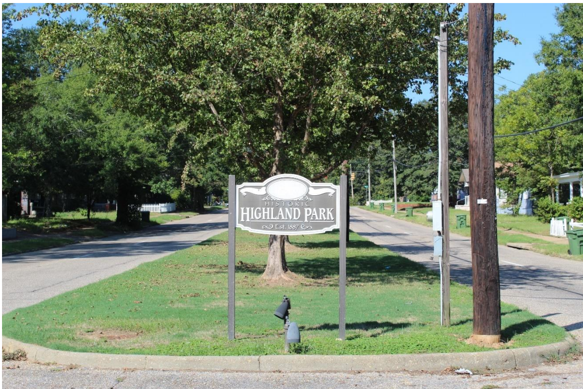
Figure 13: "Historic Highland Park, Est. 1887," 09/19/24.