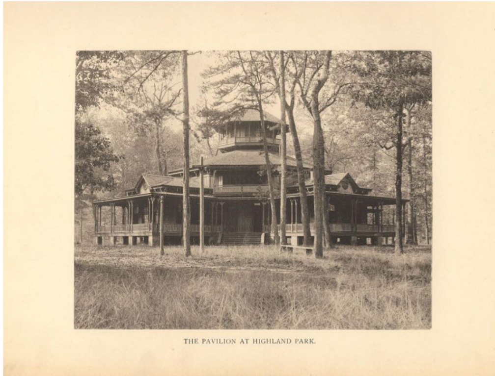
Figure 6: The Pavilion at Highland Park, c. 1894.