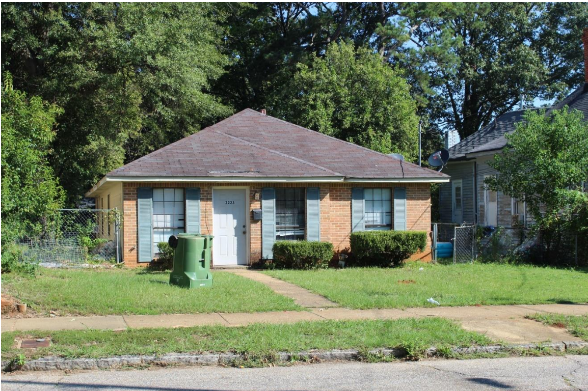
Figure 19: 2223 Highland Ave., 09/19/24.