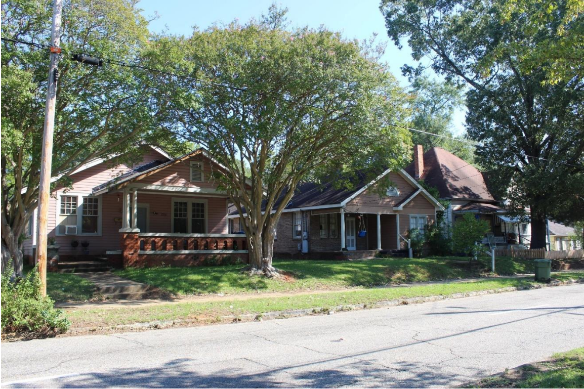
Figure 16: 2201 and 2209 Highland Ave., 09/19/24.