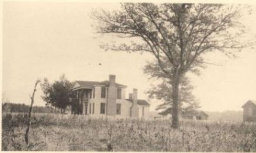
A TYPICAL SOUTHERN FARM HOUSE NEAR HIGHLAND PARK.