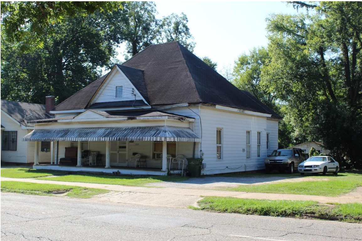
Figure 21: 2322 Highland Ave., 09/19/24.