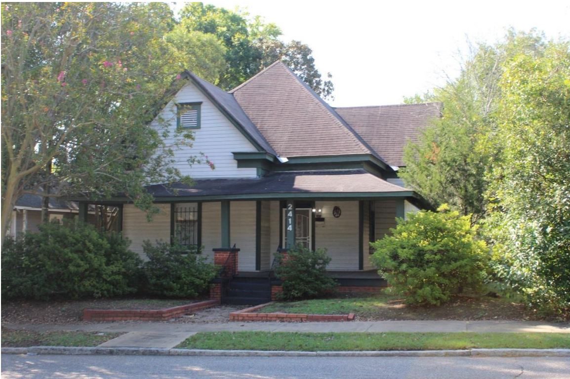
Figure 21: 2414 Highland Ave., 09/19/24.