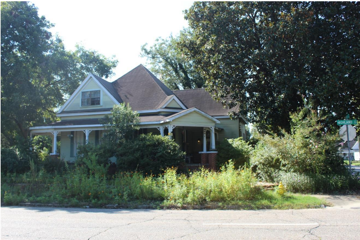
Figure 17: 2202 Highland Ave., 09/19/24.