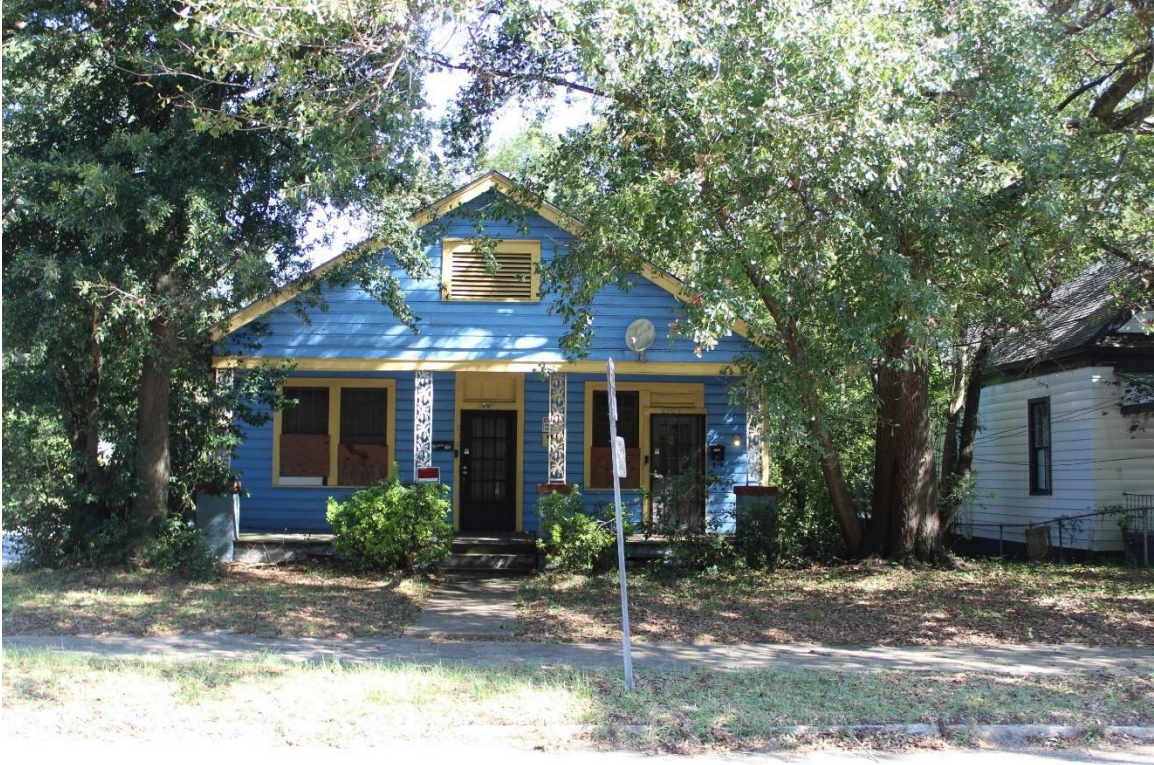
Figure 20: 2301 Highland Ave., 09/19/24.