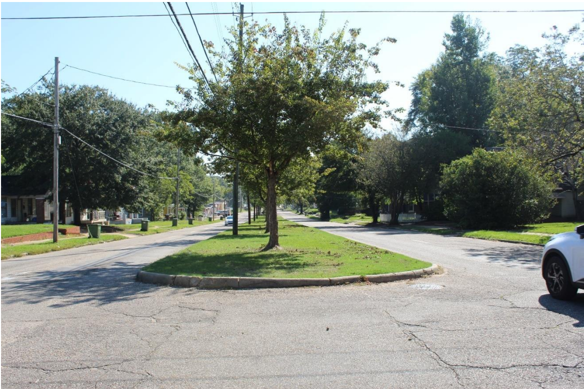
Figure 15: Highland Avenue median and streetscape 2, 09/19/24.