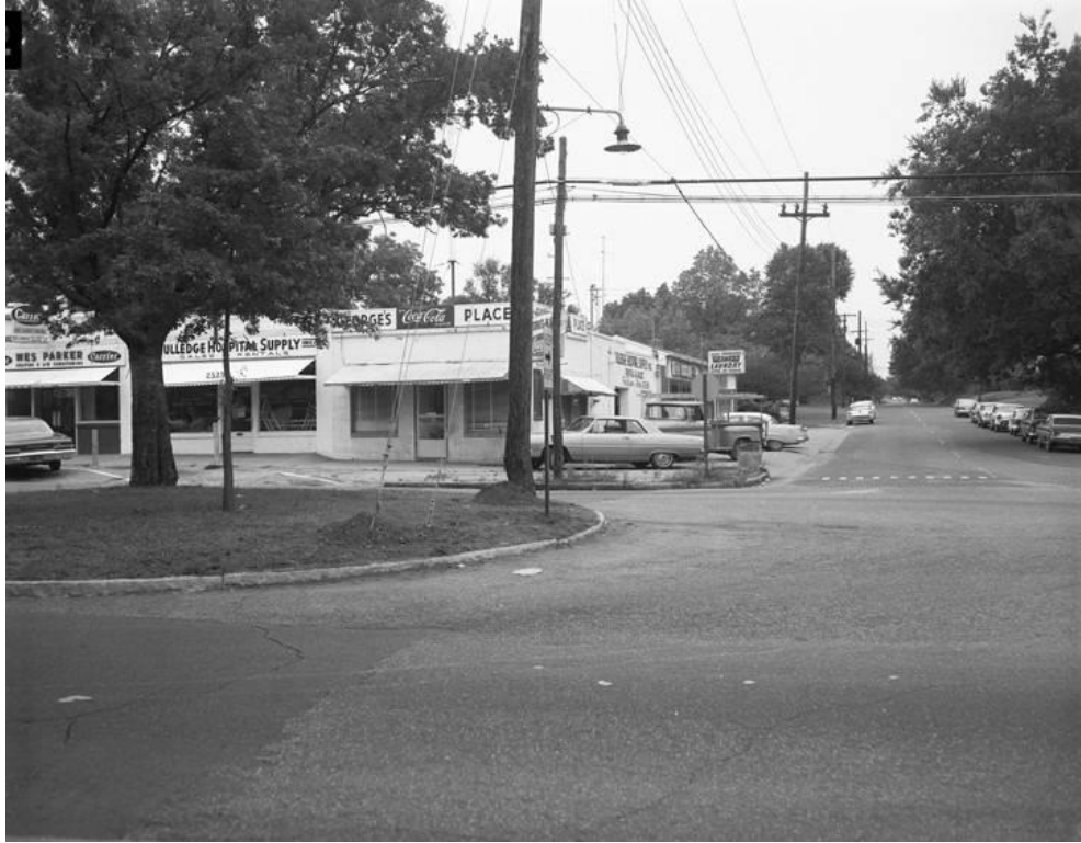
Figure 8: Highland Avenue, east of the intersection with S. Panama St.