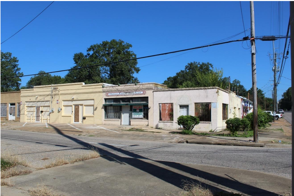
Figure 9: Repeat photograph depicting the deterioration of this one-story commercial node at intersection of Highland Ave. and S. Panama St.