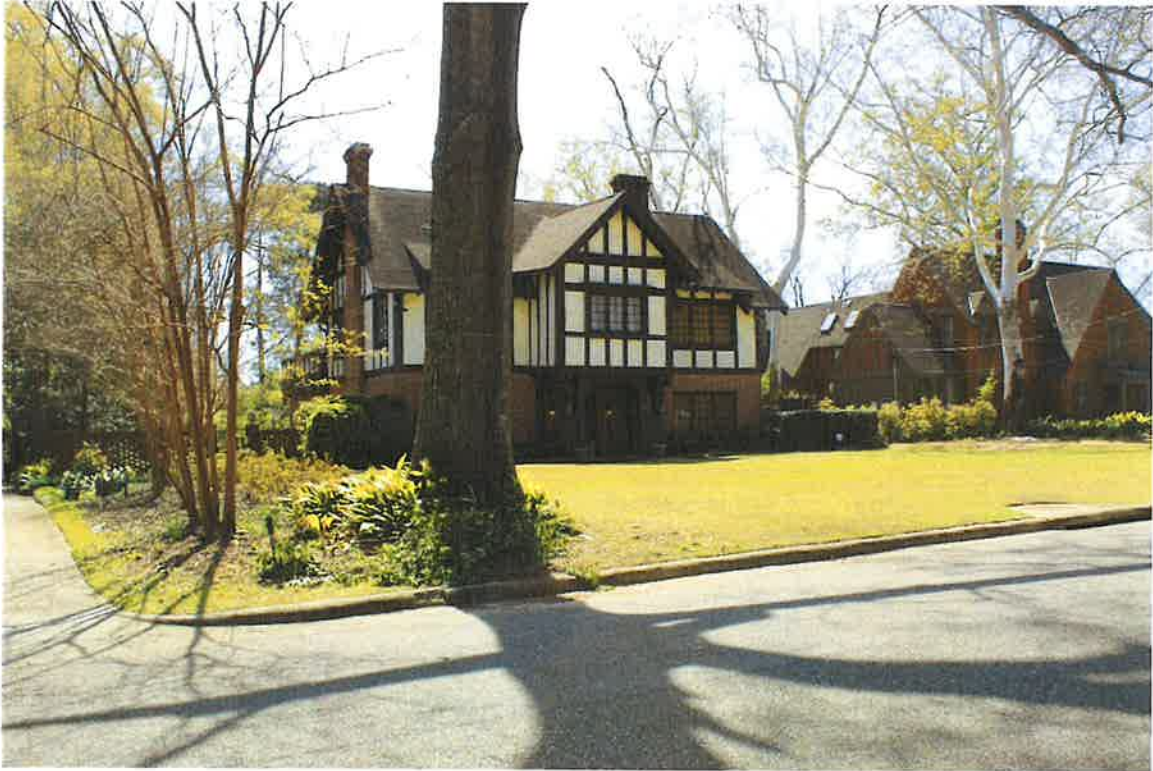
Figure 5: 728 Thorn Place, east elevation, and north façade, 03/14/2024