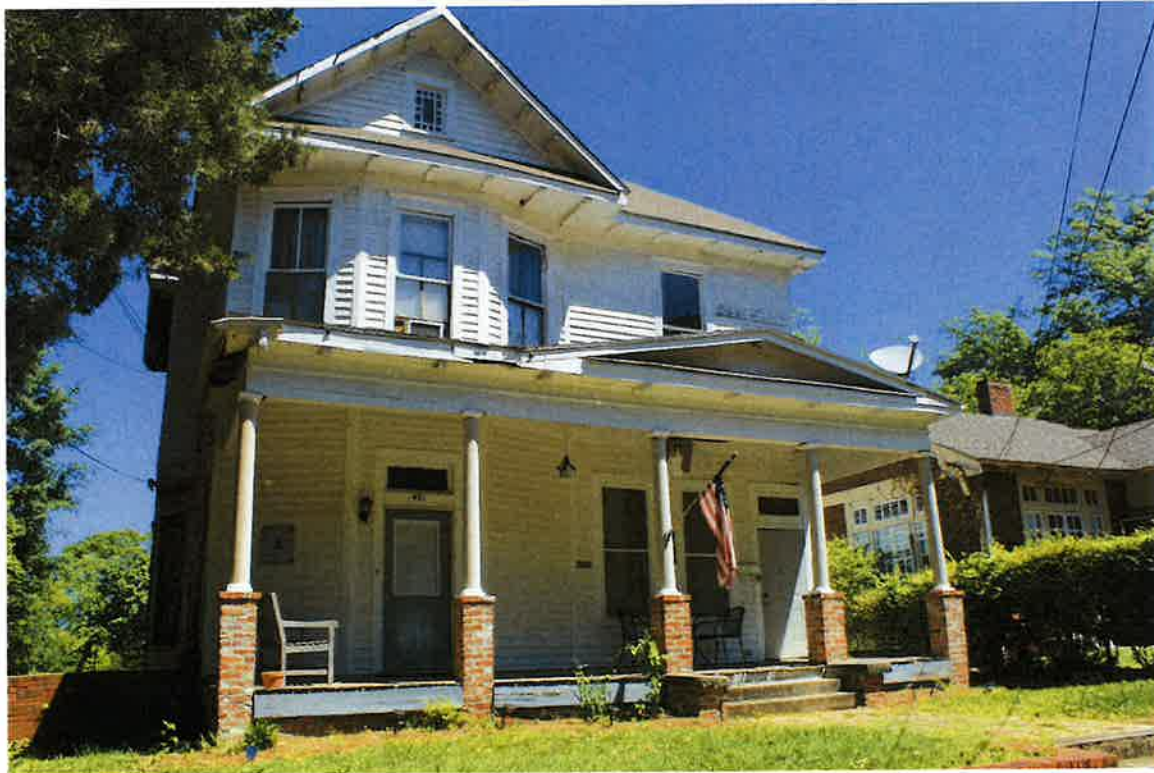
Figure 7: 431 S. Highland Court, S. façade.