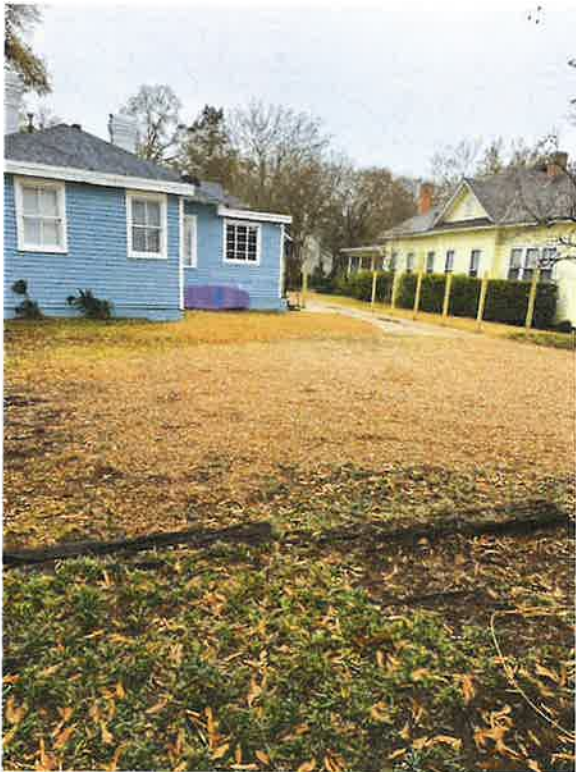
Figure 2: 529 Felder Ave, view from the rear yard