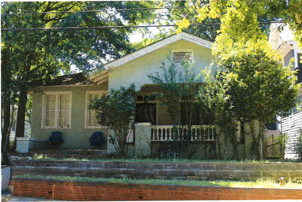
Figure 6: 424 S. Highland Court, N. façade.