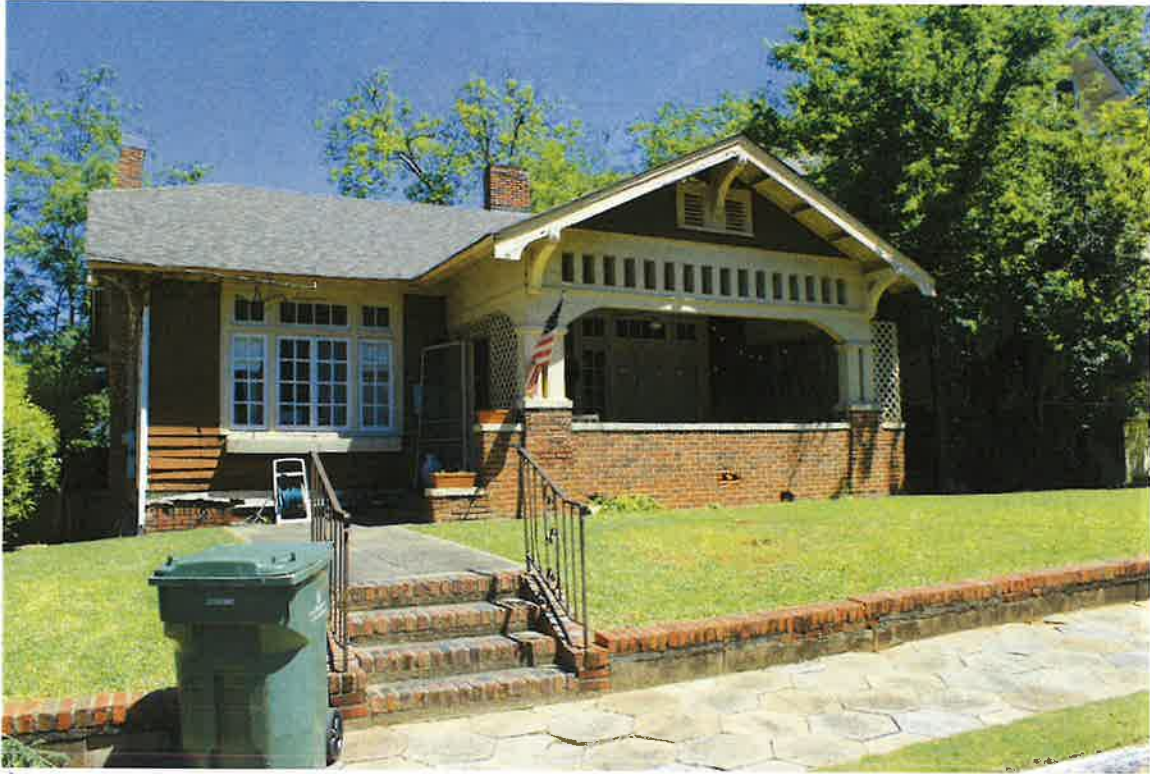
Figure 8: 437 S. Highland Court, S. façade.