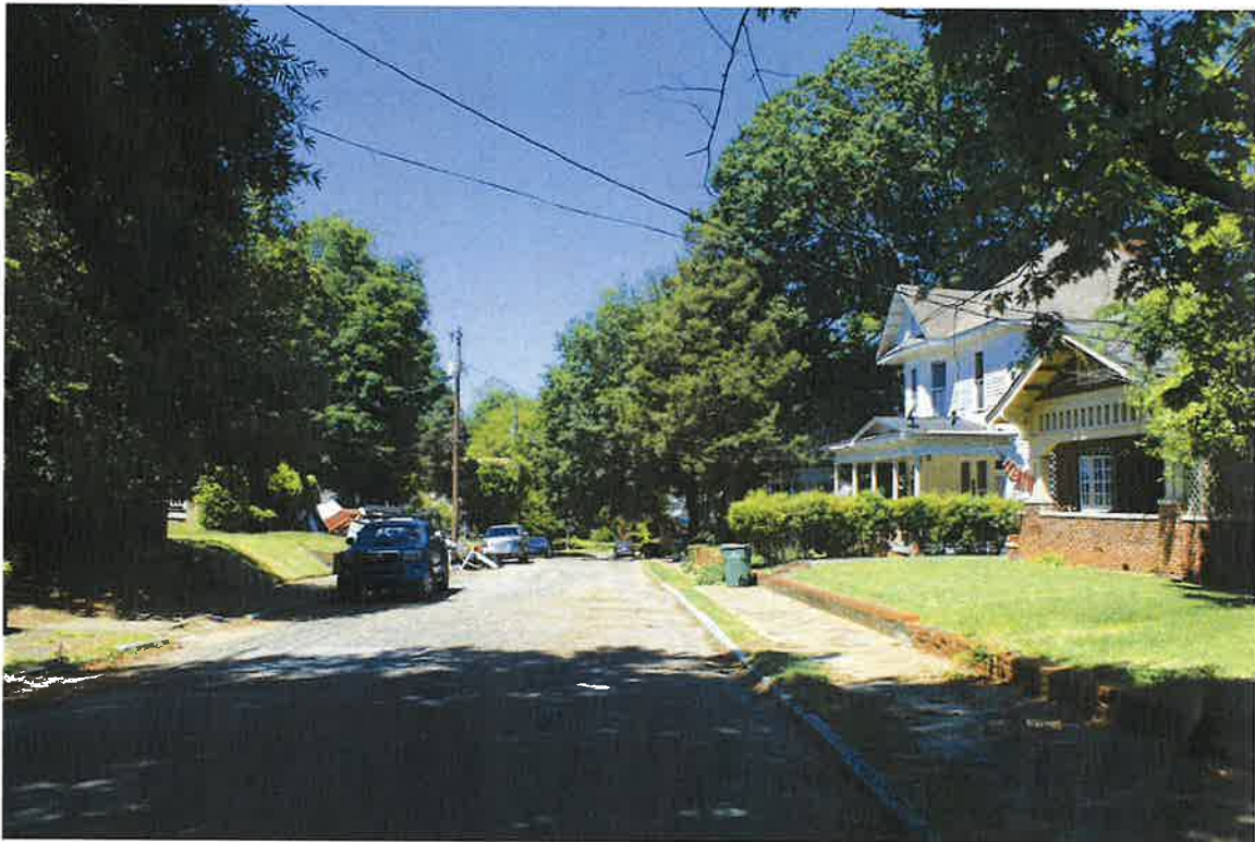
Figure 5: S. Highland Court Streetscape, facing West.