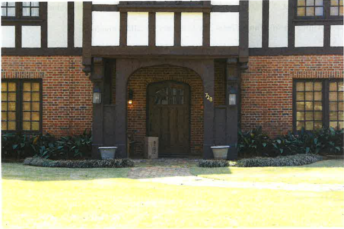
Figure 6: 728 Thorn Pl, main entry door detail, 03/14/2024