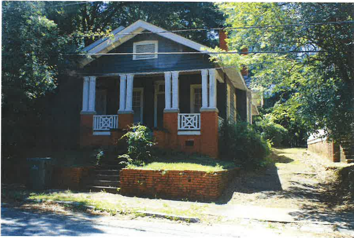
Figure 9: 440 S. Highland Court, N. façade.