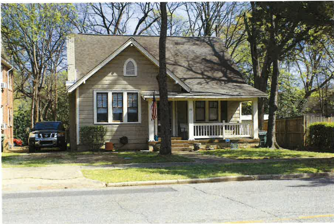
Figure 13: 20 N. Capitol Pkwy, west facade, 03/14/2024