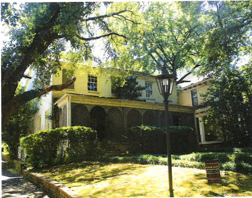
Figure 11: 1101 S. Hull St., W. façade.