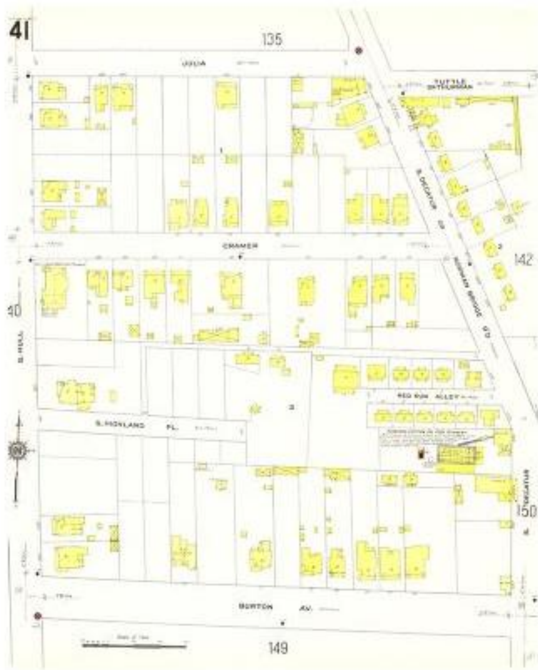
Figure 2: South Highland Place, Sanborn Maps, 1910. https://tinyurl.com/5n6j96sr .