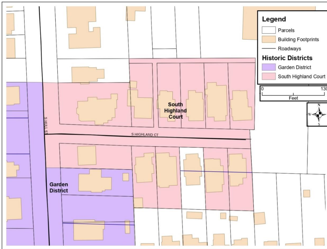
Figure 1: South Highland Court Historic District boundary map