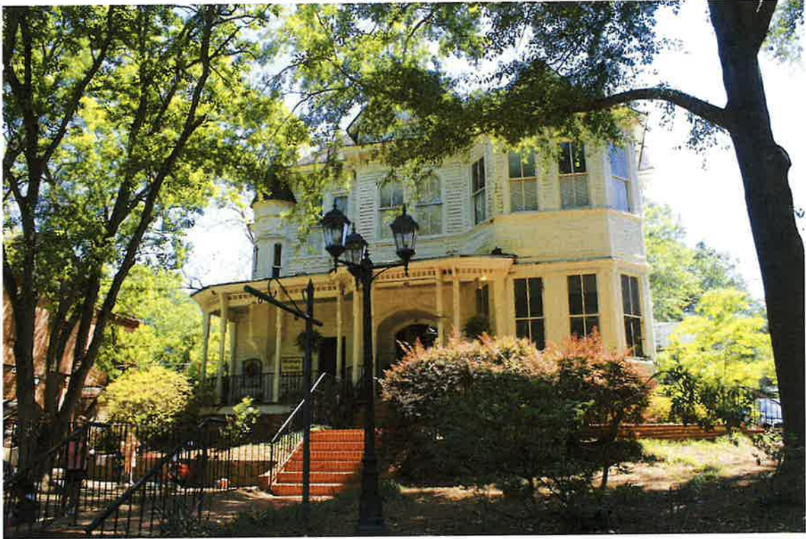
Figure 10: 1033 S. Hull St., W. façade.