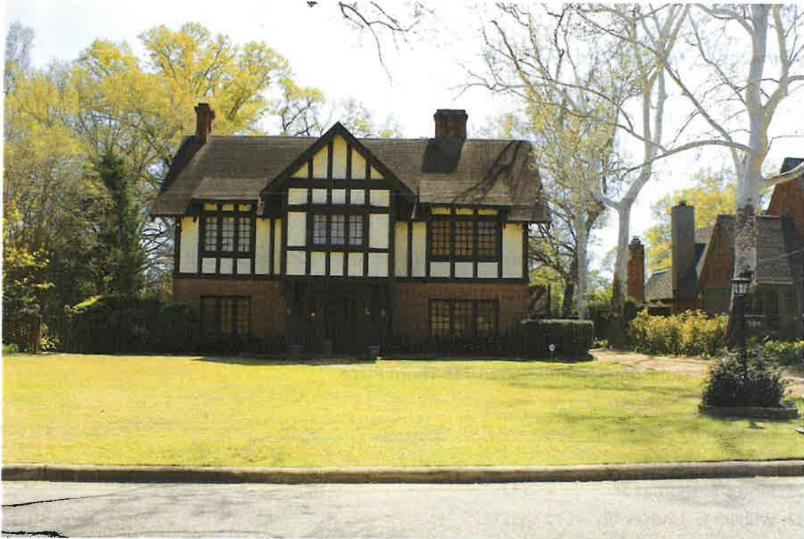
Figure 4: 728 Thorn Place, north façade, 03/14/2024