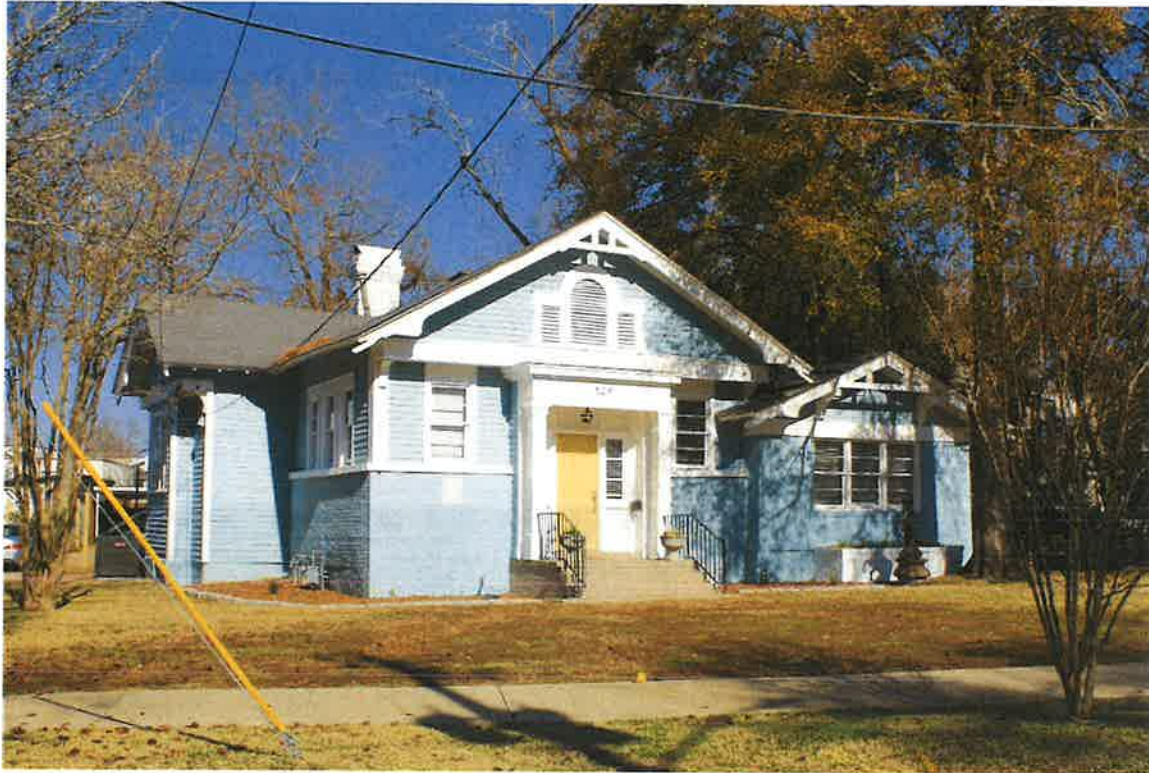
Figure 14: 529 Felder Ave, west elevation, and south façade