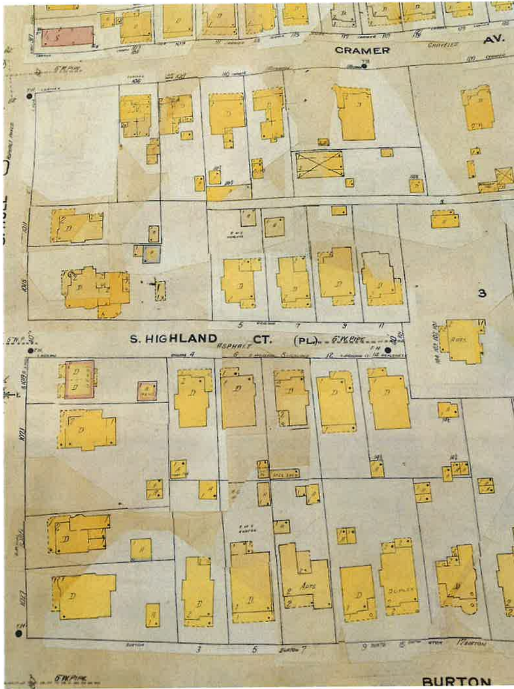
Figure 3: South Highland Place, Sanborn Maps, c. 1928.