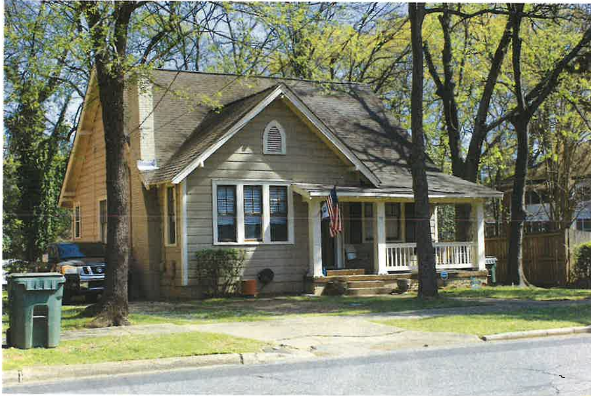
Figure 12: 20 N. Capitol Pkwy, north elevation, and west facade, 03/14/2024

Historic District: Capitol Heights—St. Charles