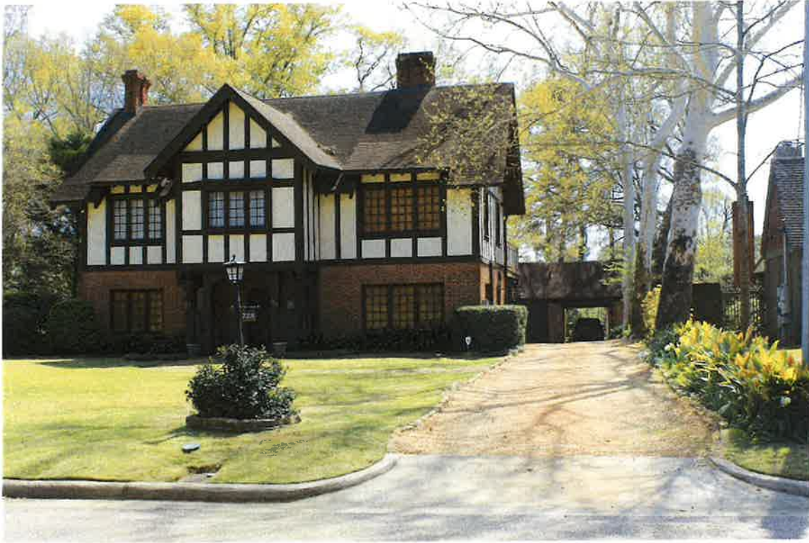
Figure 16: 728 Thorn Place, north facade, and west elevation, 03/14/2024

Construction date: c. 1909-1914 (Tax Assessor and Montgomery Water Works)