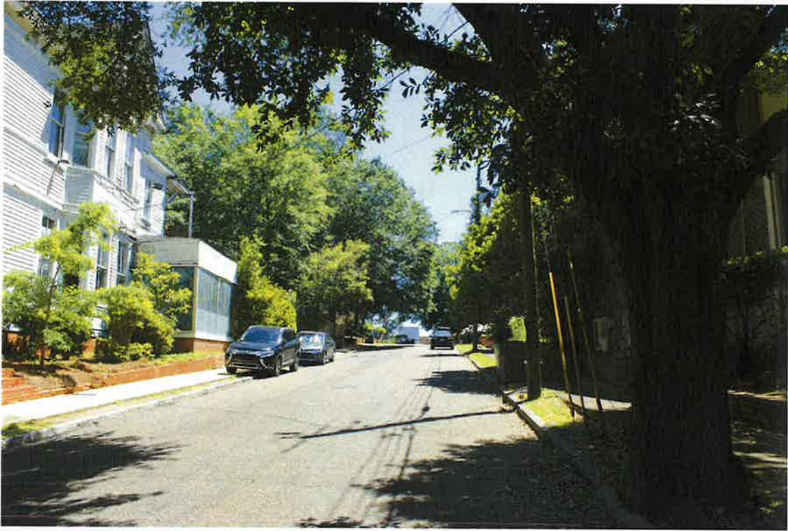
Figure 4: S. Highland Court Streetscape, facing East.