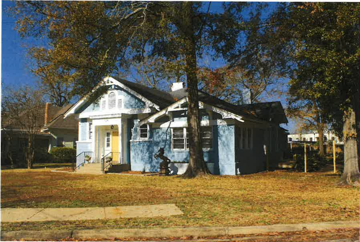
Figure 15: 529 Felder Ave, south façade, and east elevation, facing northwest