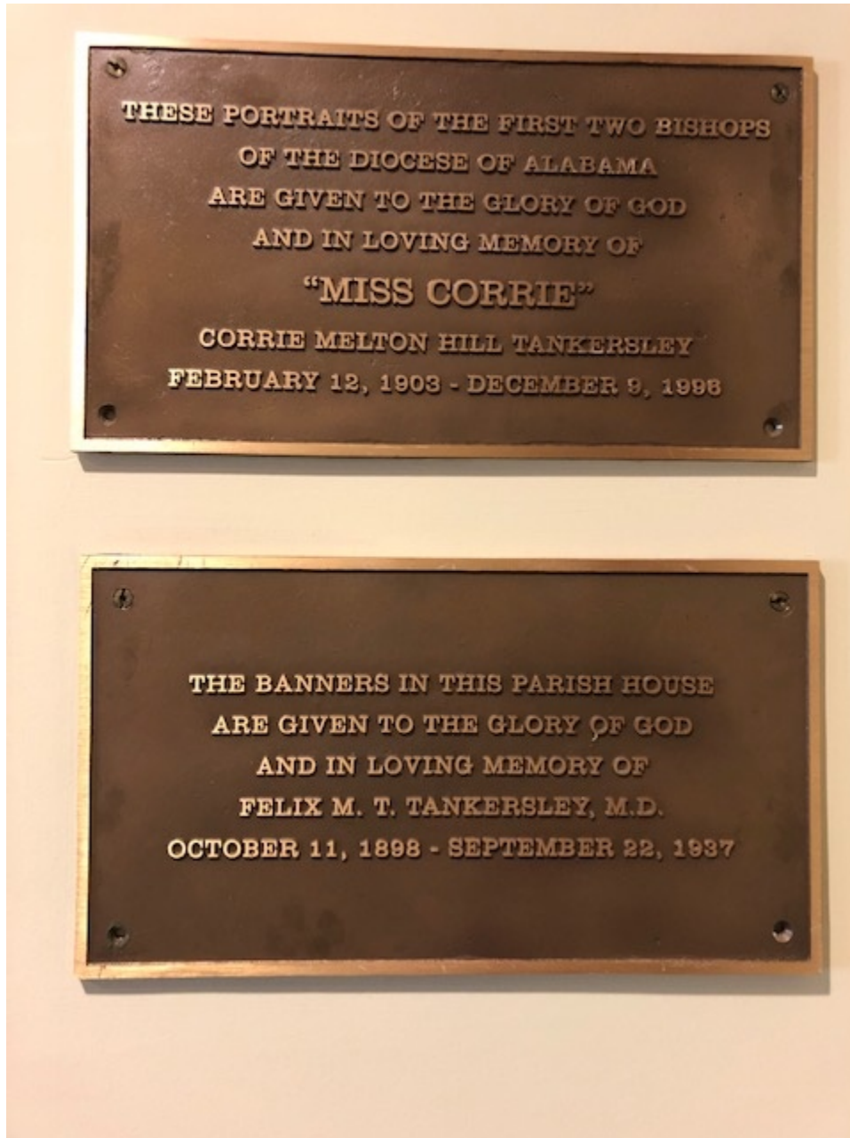
Plaques inside St. John's Episcopal Church