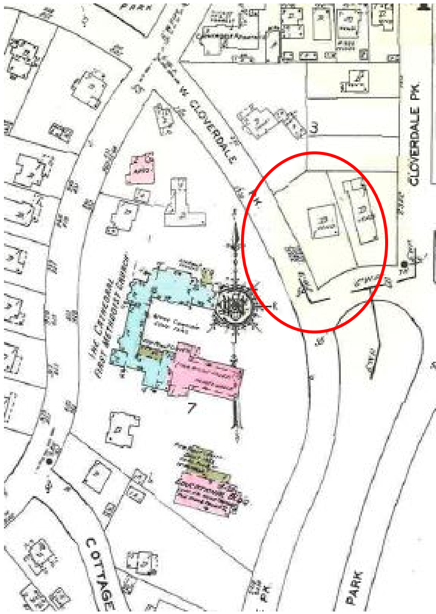
1953 Sanborn map