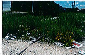
Illegal dumping and littered streets detract from the beauty of any area.

Which of these scenes would you rather see?