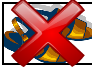
Open toe sandals